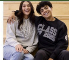
Class of 2025 Clothing & Gear