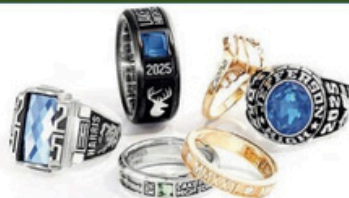
Grad Rings & Jewelry